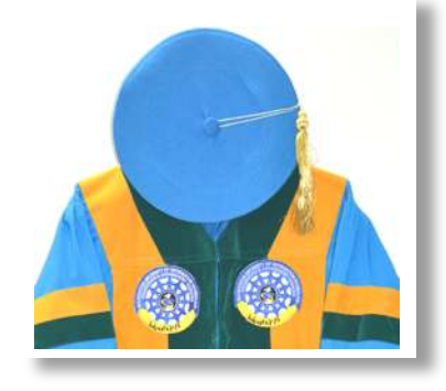
Master of Science